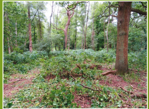
Copse Wood After Balsam Removal