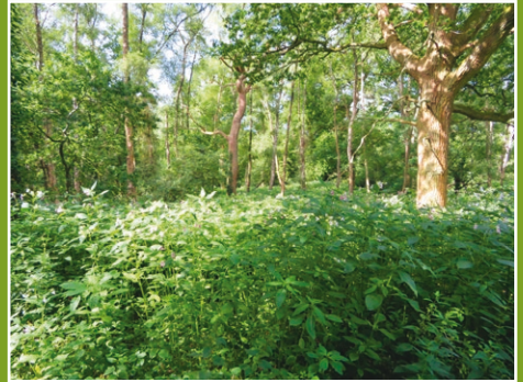
Copse Wood Before Balsam Removal

or visit our website at the address above to download a membership application form. ◆