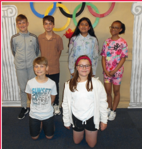
The Swift Family and Trainer