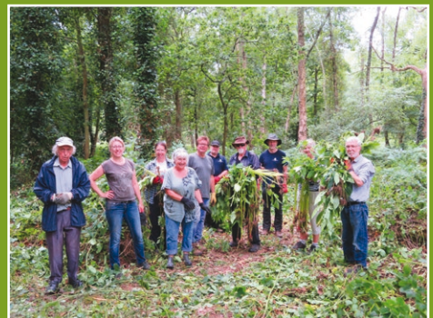
Staff and Volunteers Balsam Pulling