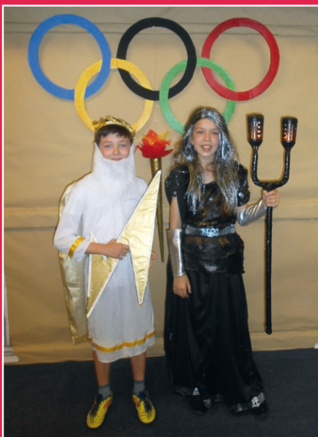
Zeus and Hades